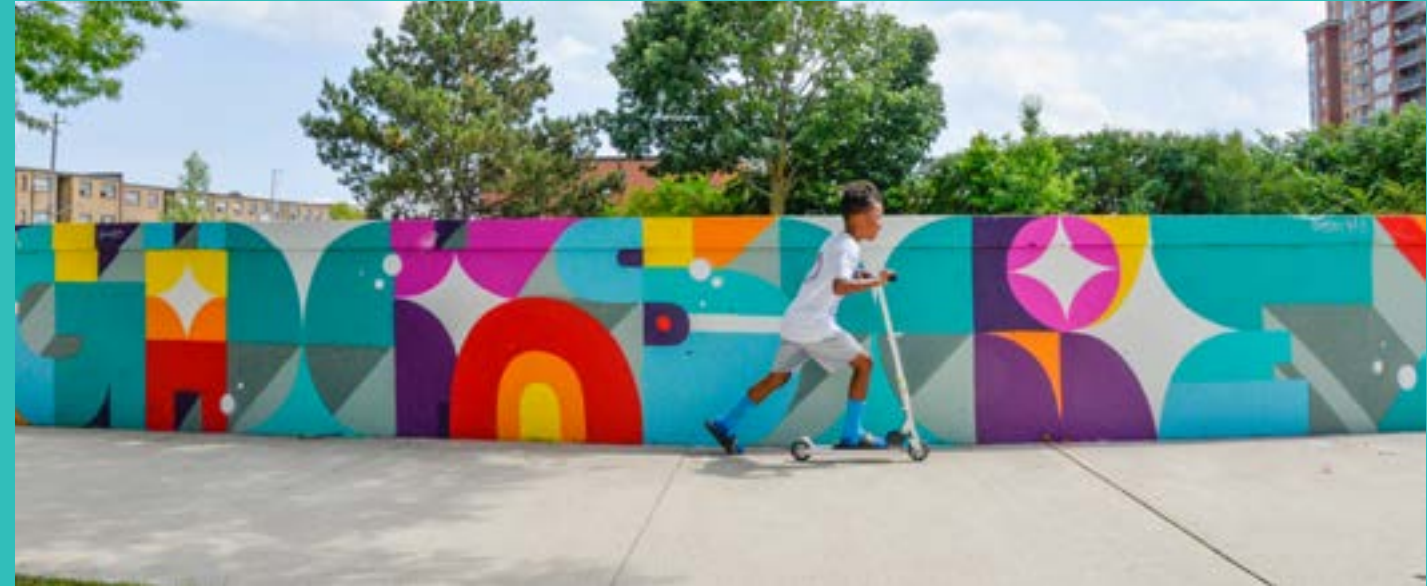
8th Street Skatepark Mural Project